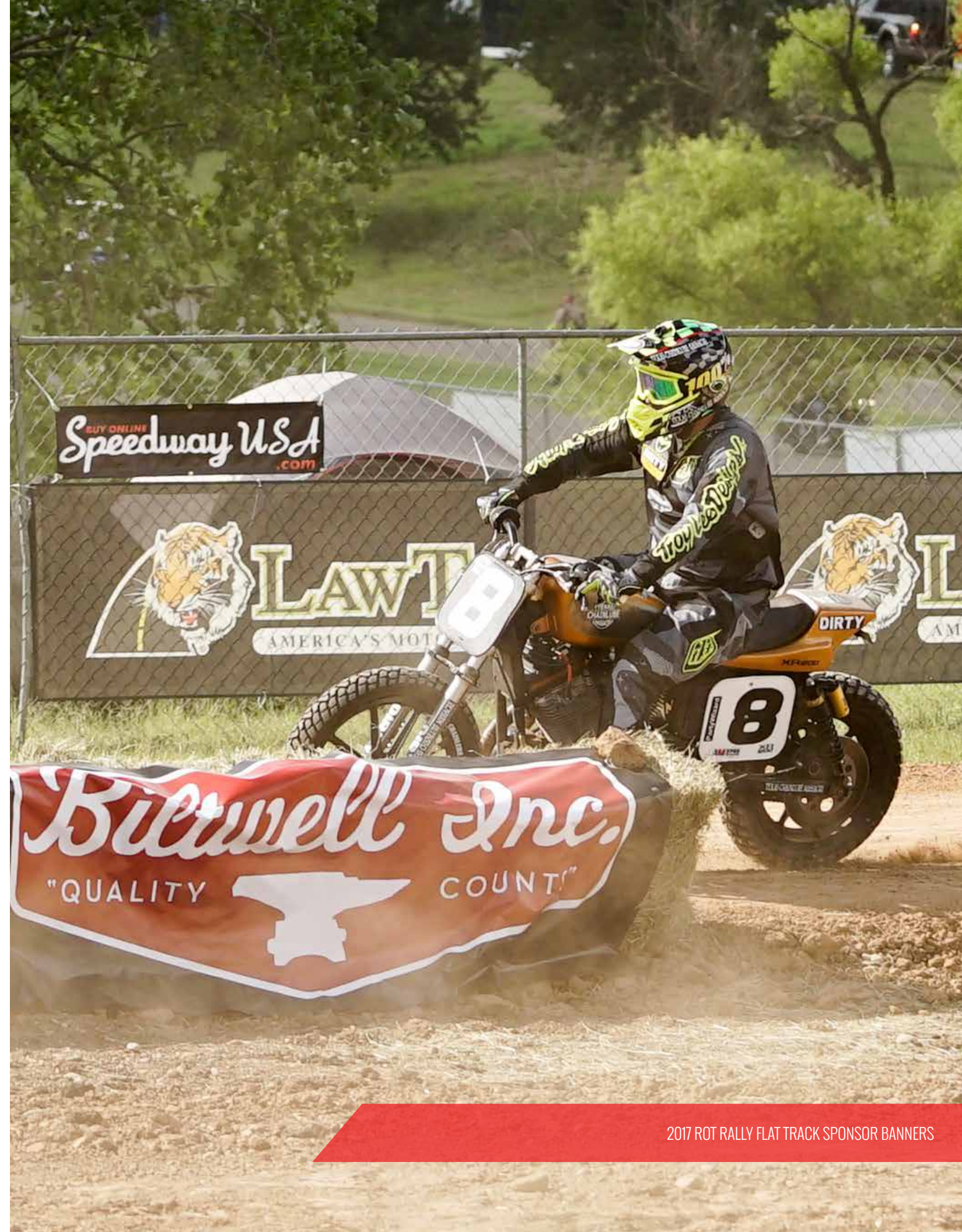
2017 ROT RALLY FLAT TRACK SPONSOR BANNERS