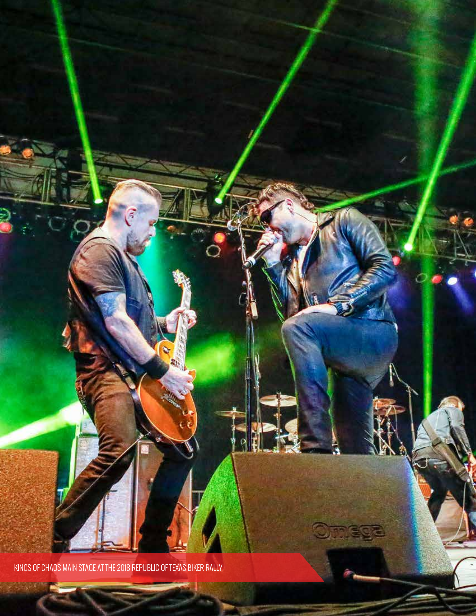
KINGS OF CHAOS MAIN STAGE AT THE 2018 REPUBLIC OF TEXAS BIKER RALLY